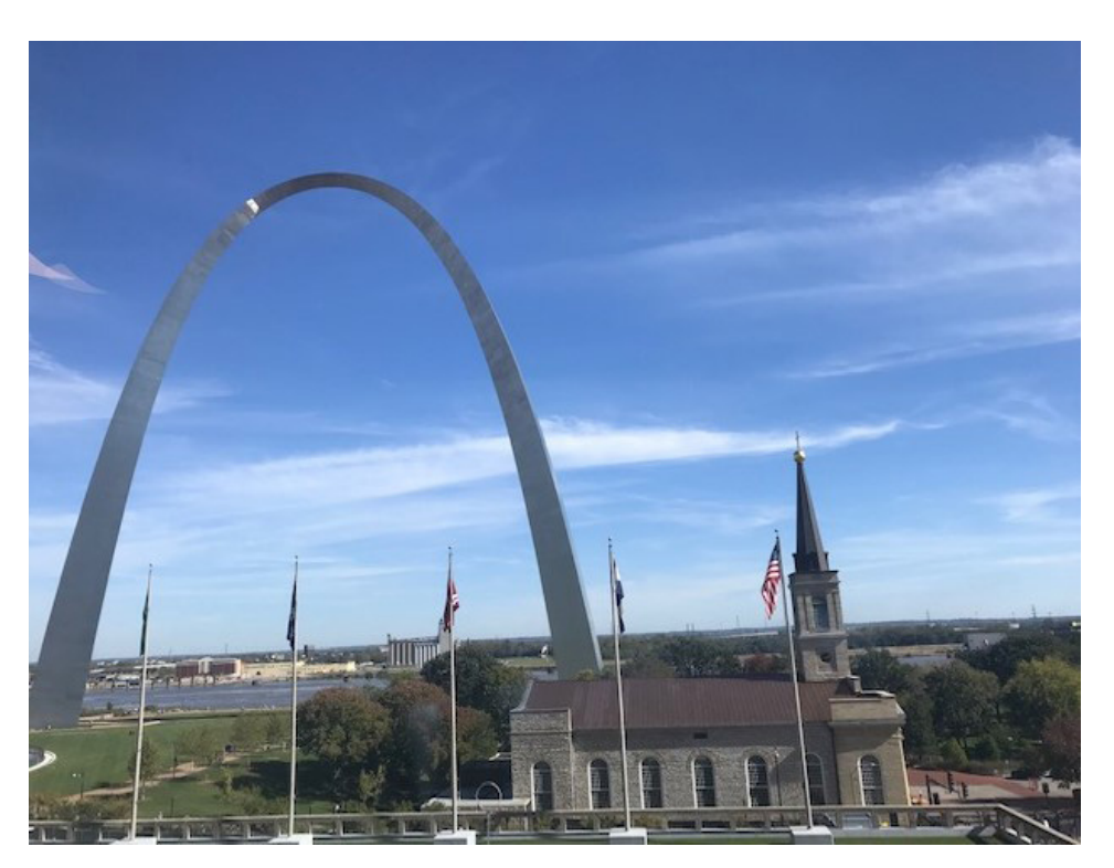
St. Louis Arch