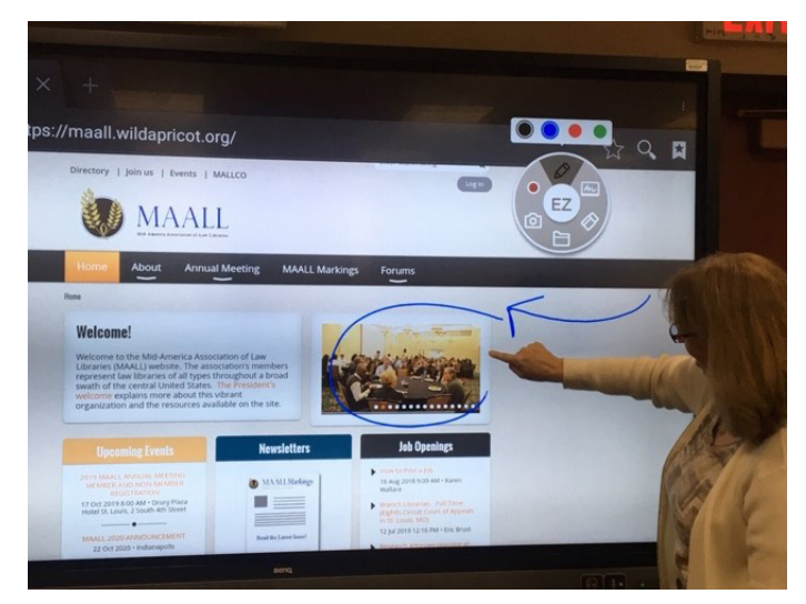
The BenQ smart board at Northern Illinois University College of Law

The lesson I am trying to take to heart this year is to move carefully, which is not my natural state. In the past I have dived in, sometimes without thinking. This is where I found myself when working with the BenQ, thinking about all the possible uses, rather than what would be the most effective and