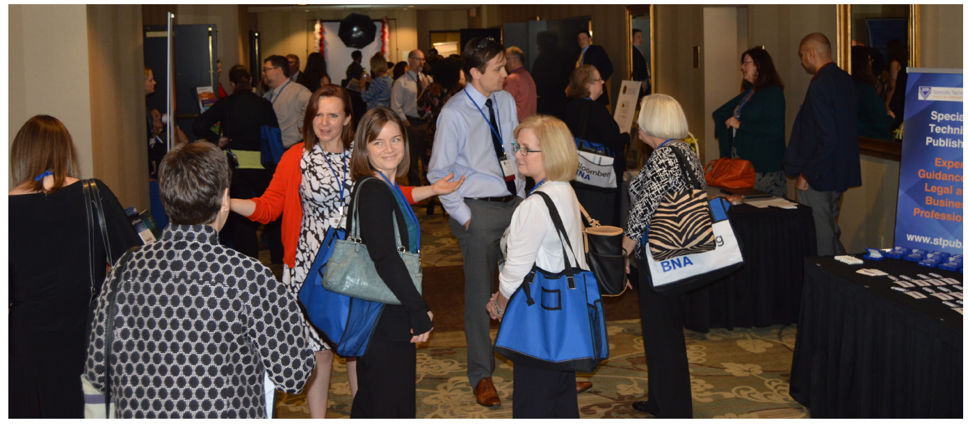
MAALL 2015 in Kansas City

Whatever happens with the name and rebranding of AALL, MAALL will continue to thrive, and I look forward to the exciting year ahead!