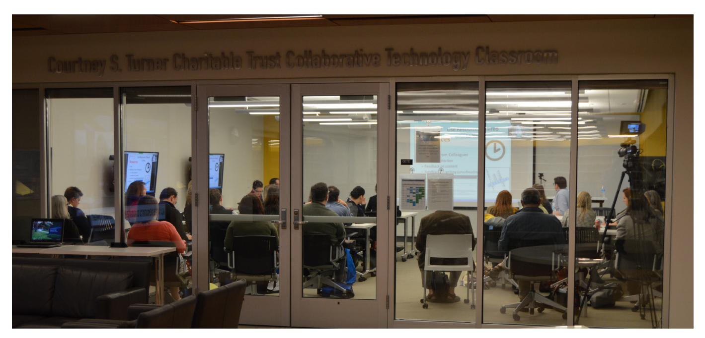
Saturday Session at UMKC

One of the great advantages of traveling to the conference is the ability to network, but many people shudder at the thought of networking. MAALL was one of the first professional conferences I was able to attend when I was a brand new law librarian (I won't tell you how long ago that was). Because it was a smaller conference, I felt much more at home than I did at the larger American Association of Law Libraries (AALL) or American Library Association (ALA) conferences. MAALL members were, and continue to be, welcoming and inclusive. That warm welcome and inclusive spirit is particularly important to introverts like me. Few things terrify me more than walking into a room full of people that I do not know, but who all know each other. Luckily, at MAALL conferences, people are happy to walk up and introduce themselves. But even better, at the last two meetings, there was a speed networking program!