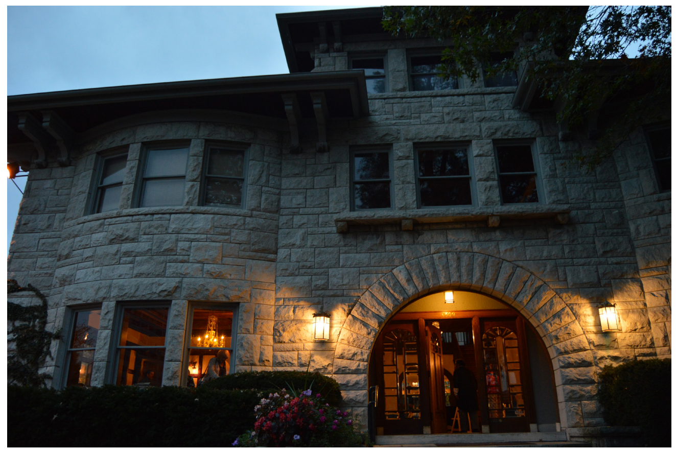
Simpson House

This was one of the most enjoyable and informative MAALL meetings that I have attended. The programs were excellent, and it was difficult to decide which sessions to attend. The Education Committee exceeded all expectations. Several new events were introduced at this meeting. One such event was the vendor demos, which highlighted features of databases and new products. The demos I attended were well-received. Another new event was the Books to Action program, and I hope that MAALL continues to assist prisons (or other groups) in obtaining books that they need. The book we read, Just Mercy , is a powerful reminder about the legal system and justice in the U.S. I am glad I helped with the program. It comforts me to know that my books will be going to others who will enjoy them as much as I have. (If anyone would like to donate a book(s) to the Missouri Prison Library System, please email me at hartkelk@slu.edu and I will send you information.)