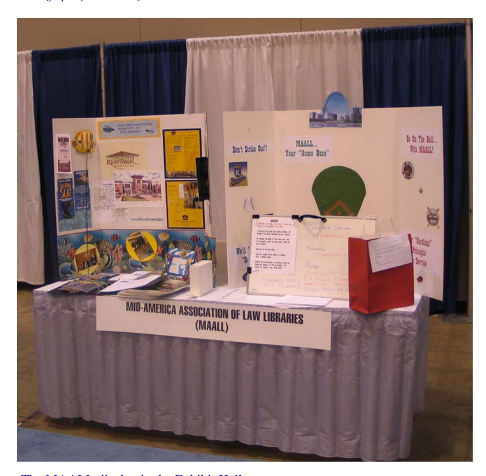
The MAALL display in the Exhibit Hall