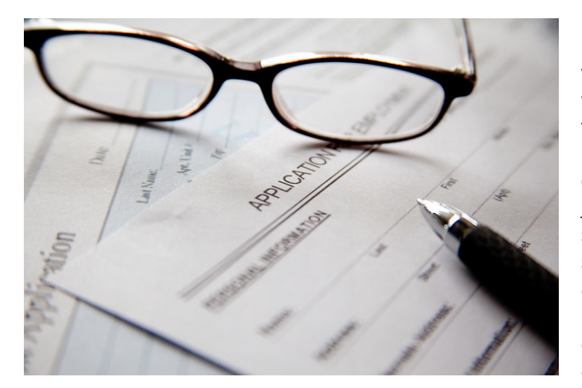
Application – glasses – pen

Ideally, as a supervisor, you will make sure that each staff person has a title and a job description that aligns with what they really do. You may or may not be able to control the formal part of that process. But what you can do is to make sure that you are utilizing the best skills of each person working under your supervision at