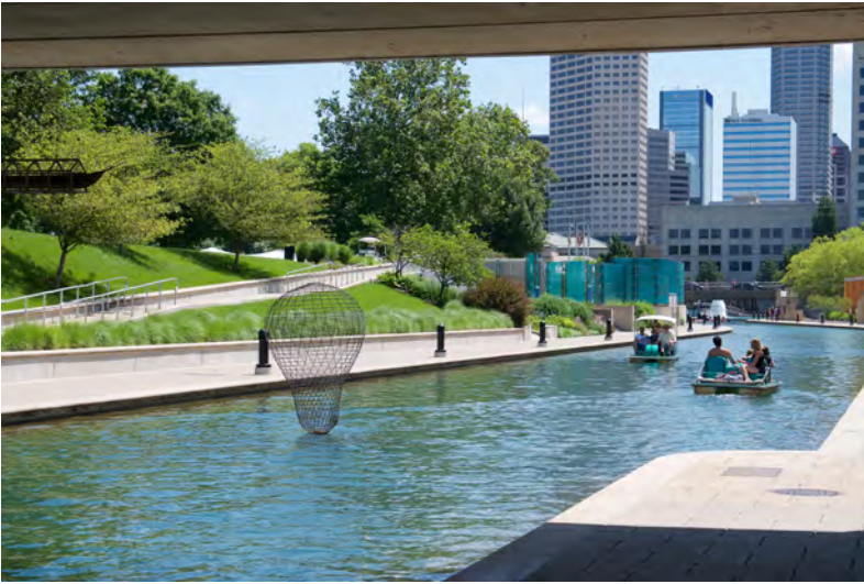
Indianapolis Canal Walk

I would also like to congratulate the MAALL members who garnered an impressive collection of AALL awards this year. We all know how remarkable our members are but these accomplishments ensure that our colleagues outside of the Midwest know it too. Congratulations are also in order for all of the candidates who ran in our recent election. We have an impressive group of officers joining the Board later this year and our organization is in great hands moving forward.