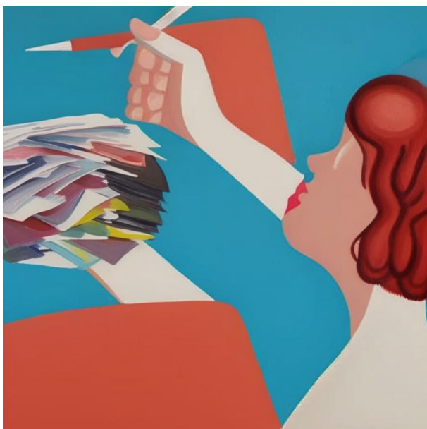
Illustration by Brent Greyson

Yet, for all the stress it can (and does) create, it is also a very rewarding process. As I go through the tenure process, looking back at 5+ years of work is very encouraging. It is also a reminder that at one point or another, I was facing the difficulties I discussed above and worked through them, which is empowering and invigorating. It also reminds me of the difficulty I faced when I first started, and the value of all of the assistance and guidance I had along the way — which I hope to impart upon you, dear reader.