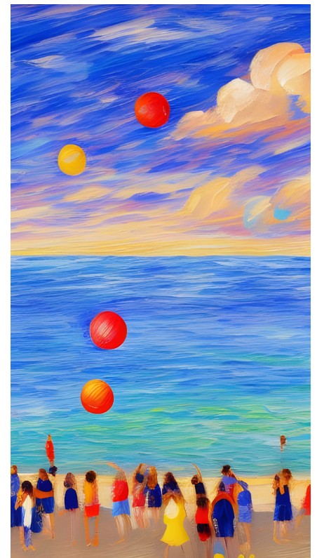
Illustration generated using Nightcafe