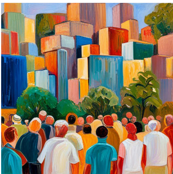
Illustration generated using Nightcafe