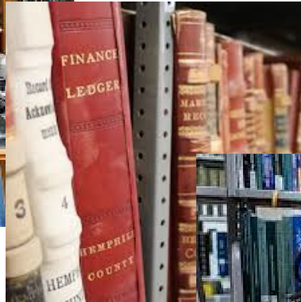
Unique, meaningful collections