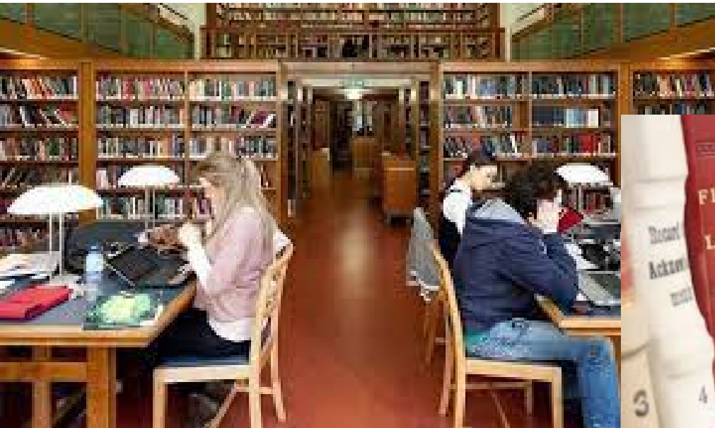
Focused learning space