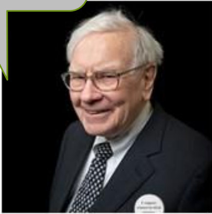
Buffett Wants To Be Your Mentor